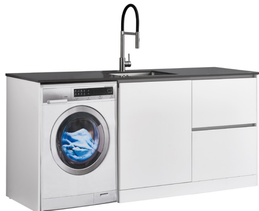
LEV19RDODRCCMW (Matt White Cabinet)

Tapware, appliances, accessories and wastes not included, unless otherwise stated. Please note measurements are nominal only, please measure product on site. Actual colours may vary.