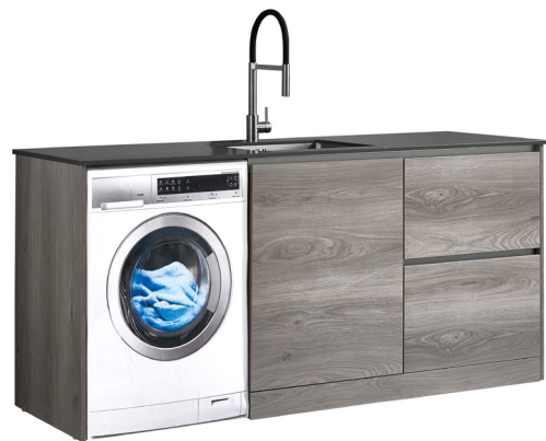
LEV19RDODRCCEL (Elm Woodgrain Cabinet)