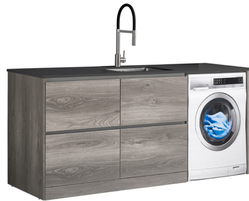
LEV19LDRDRCCCEL (Elm Woodgrain Cabinet)