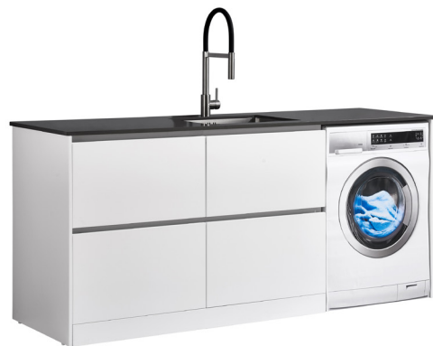
LEV19LDRDRCCMW (Matt White Cabinet)

Tapware, appliances, accessories and wastes not included, unless otherwise stated. Please note measurements are nominal only, please measure product on site. Actual colours may vary.