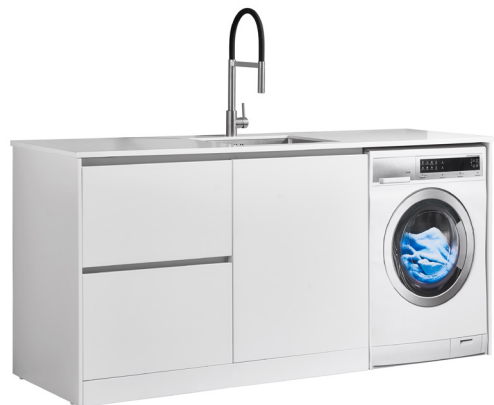
LEV19LDODRWHMW (Matt White Cabinet)

Tapware, appliances, accessories and wastes not included, unless otherwise stated. Please note measurements are nominal only, please measure product on site. Actual colours may vary.