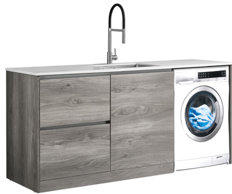
LEV19LDODRWHEL (Elm Woodgrain Cabinet)