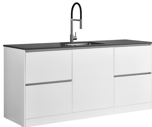
LEV19DRDODRCCMW (Matt White Cabinet)

Tapware, appliances, accessories and wastes not included, unless otherwise stated. Please note measurements are nominal only, please measure product on site. Actual colours may vary.