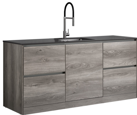
LEV19DRDODRCCEL (Elm Woodgrain Cabinet)