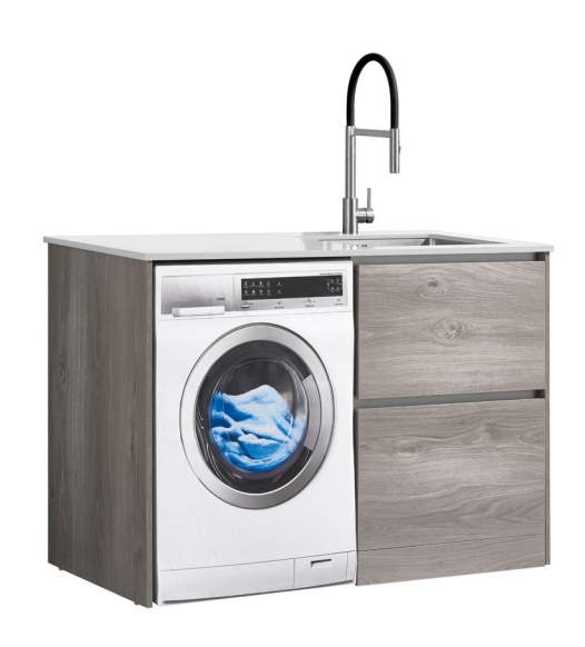
LEVI3RDRWHEL (Elm Woodgrain Cabinet)