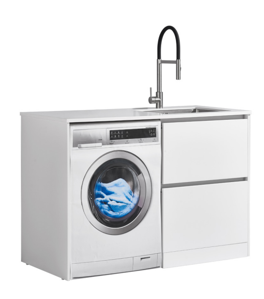
LEV13RDRWHMW (Matt White Cabinet)

Tapware, appliances, accessories and wastes not included, unless otherwise stated. Please note measurements are nominal only, please measure product on site. Actual colours may vary.