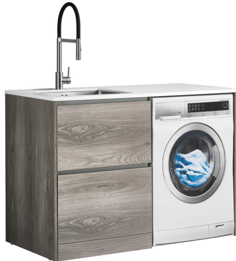
LEVI3LDRWHEL (Elm Woodgrain Cabinet)