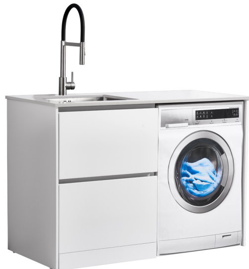
LEVI3LDRWHMW (Matt White Cabinet)

Tapware, appliances, accessories and wastes not included, unless otherwise stated. Please note measurements are nominal only, please measure product on site. Actual colours may vary.