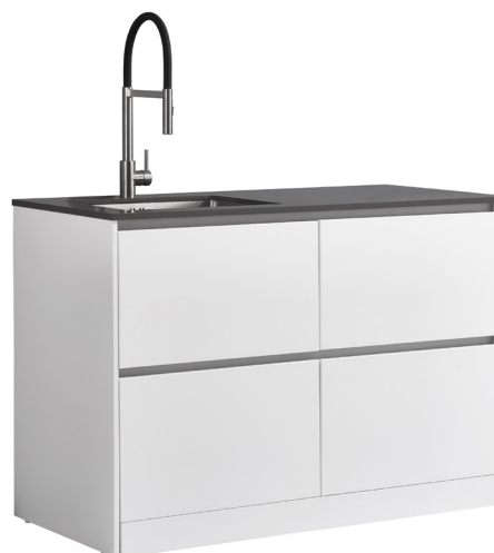
LEV13LDRDRCCMW (Matt White Cabinet)

Tapware, appliances, accessories and wastes not included, unless otherwise stated. Please note measurements are nominal only, please measure product on site. Actual colours may vary.