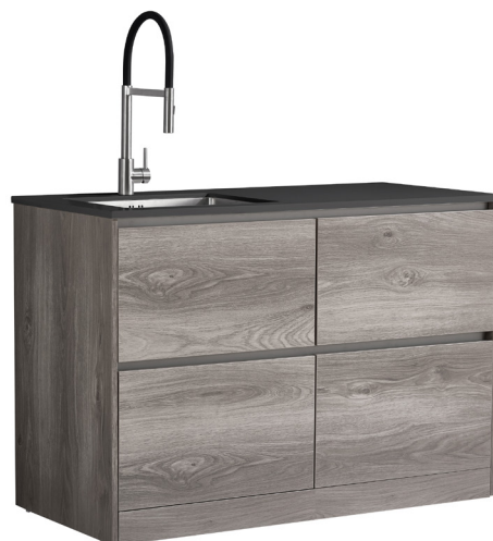
LEV13LDRDRCCCEL (Elm Woodgrain Cabinet)