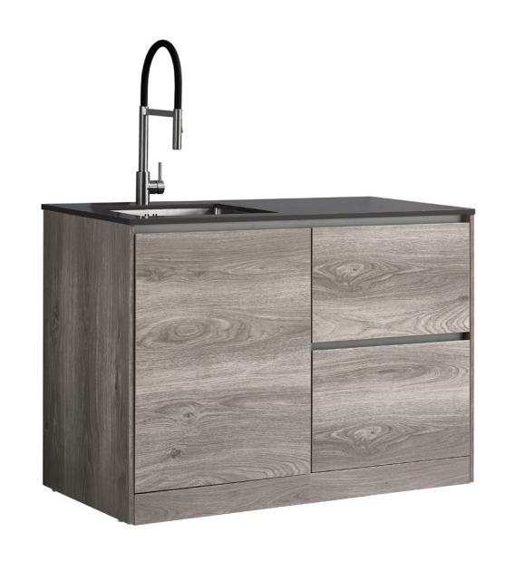
LEV13LDODRCCEL (Elm Woodgrain Cabinet)