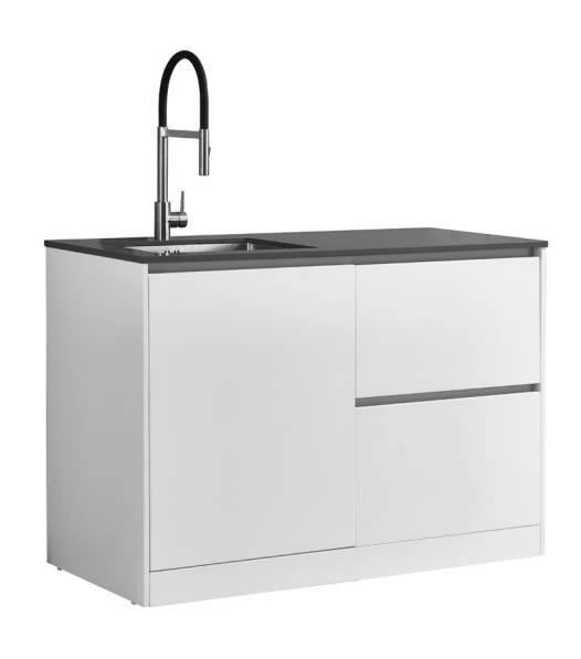
LEV13LDODRCCMW (Matt White Cabinet)

Tapware, appliances, accessories and wastes not included, unless otherwise stated. Please note measurements are nominal only, please measure product on site. Actual colours may vary.