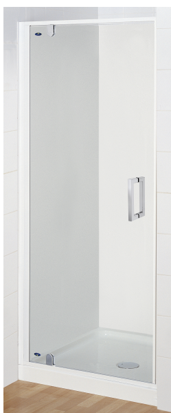
Note: Tapware and accessories illustrated in photography are not included

The Azure II Alcove Pivot Shower is available in a range of sizes and wall options. The pivot door is available in white frame finish. The enclosure features a fully reversible door with 6mm toughened safety glass, protected by Englefield CleanLess® glass treatment. The Quick-Fit low profile tray with centre waste features an ultra high 40mm upstand to enhance watertightness for long lasting performance.